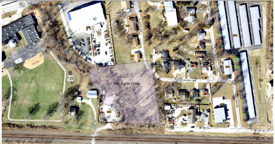
108 Curtis Dr, St Louis Co Mapping