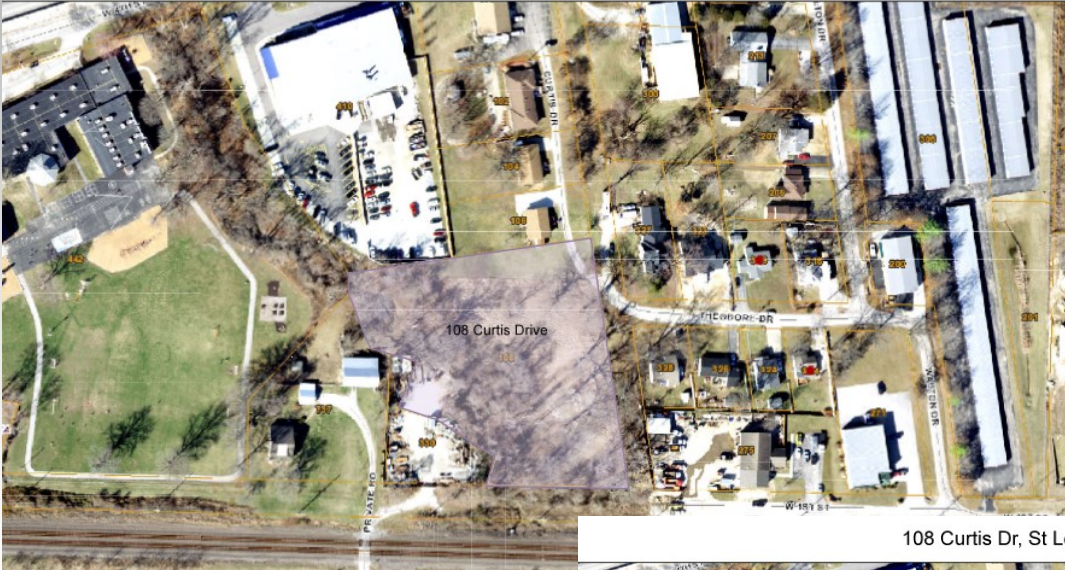
108 Curtis Dr, St Louis Co Mapping